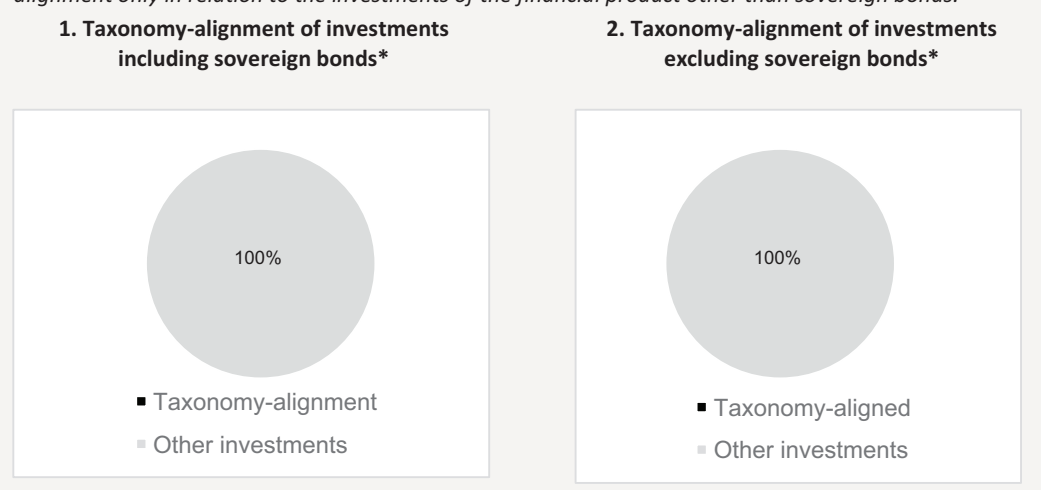
*For the purpose of these graphs, 'sovereign bonds' consist of all sovereign exposures

The two graphs below show in green the minimum percentage of investments that are aligned with the EU Taxonomy. As there is no appropriate methodology to determine the Taxonomy-alignment of sovereign bonds*, the first graph shows the Taxonomy-alignment in relation to all the investments of the financial product including sovereign bonds, while the second graph shows the Taxonomy-alignment only in relation to the investments of the financial product other than sovereign bonds.