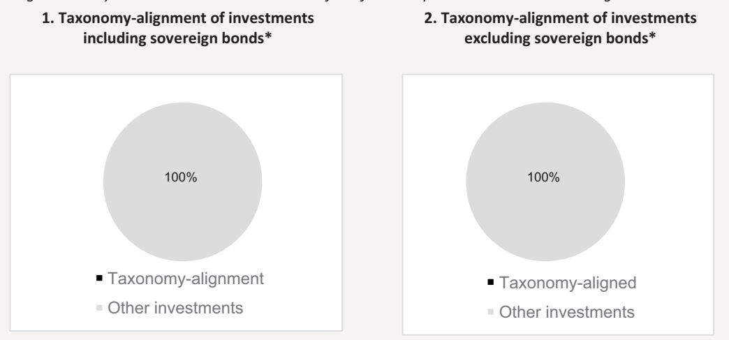
*For the purpose of these graphs, 'sovereign bonds' consist of all sovereign exposures

The two graphs below show in green the minimum percentage of investments that are aligned with the EU Taxonomy. As there is no appropriate methodology to determine the Taxonomy-alignment of sovereign bonds*, the first graph shows the Taxonomy-alignment in relation to all the investments of the financial product including sovereign bonds, while the second graph shows the Taxonomy-alignment only in relation to the investments of the financial product other than sovereign bonds.