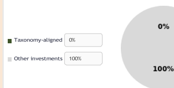
1. Taxonomy-alignment of investments including sovereign bonds*